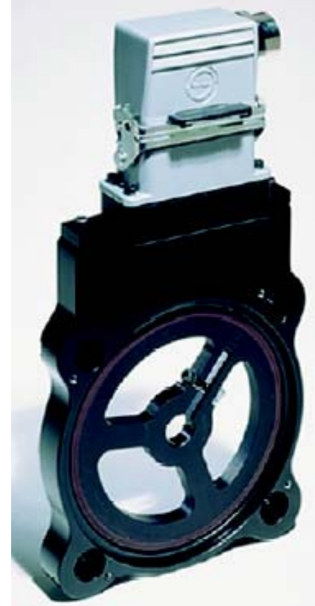
SLIM Tach® SL56